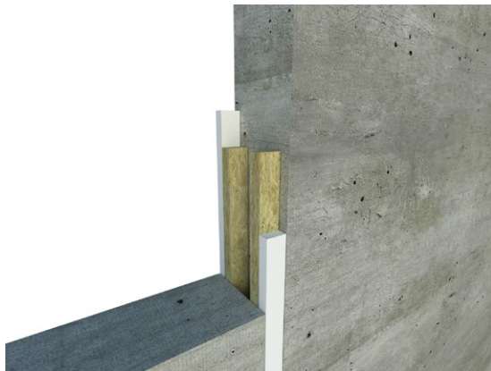
Figure 1 Double sealed joint with FIREPRO mineral wool backer

All seals to be backed with ROCKWOOL FIREPRO® mineral wool backer material (30mm depth)