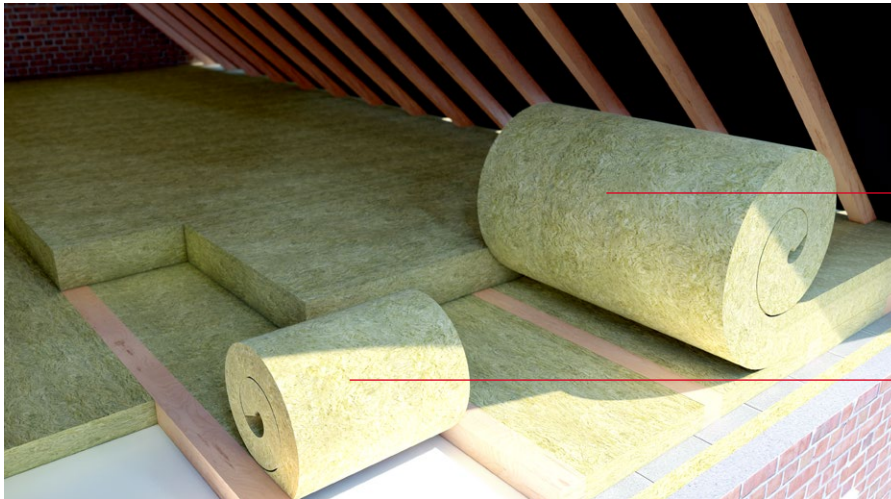
Thermal Roll crossed laid over the top of the joists at 200mm thickness

Designed for use in horizontal loft applications, the “Twin Roll” feature of ROCKWOOL Thermal Roll means it is pre-split at 100mm and 200mm thicknesses, for quick and easy installation. 100mm thickness for laying between the joists, and 200mm cross layered over the top of the joists - to give the recommended 300mm total coverage to meet thermal performance set out in Part L (Conservation of Fuel and Power) of the building regulations.